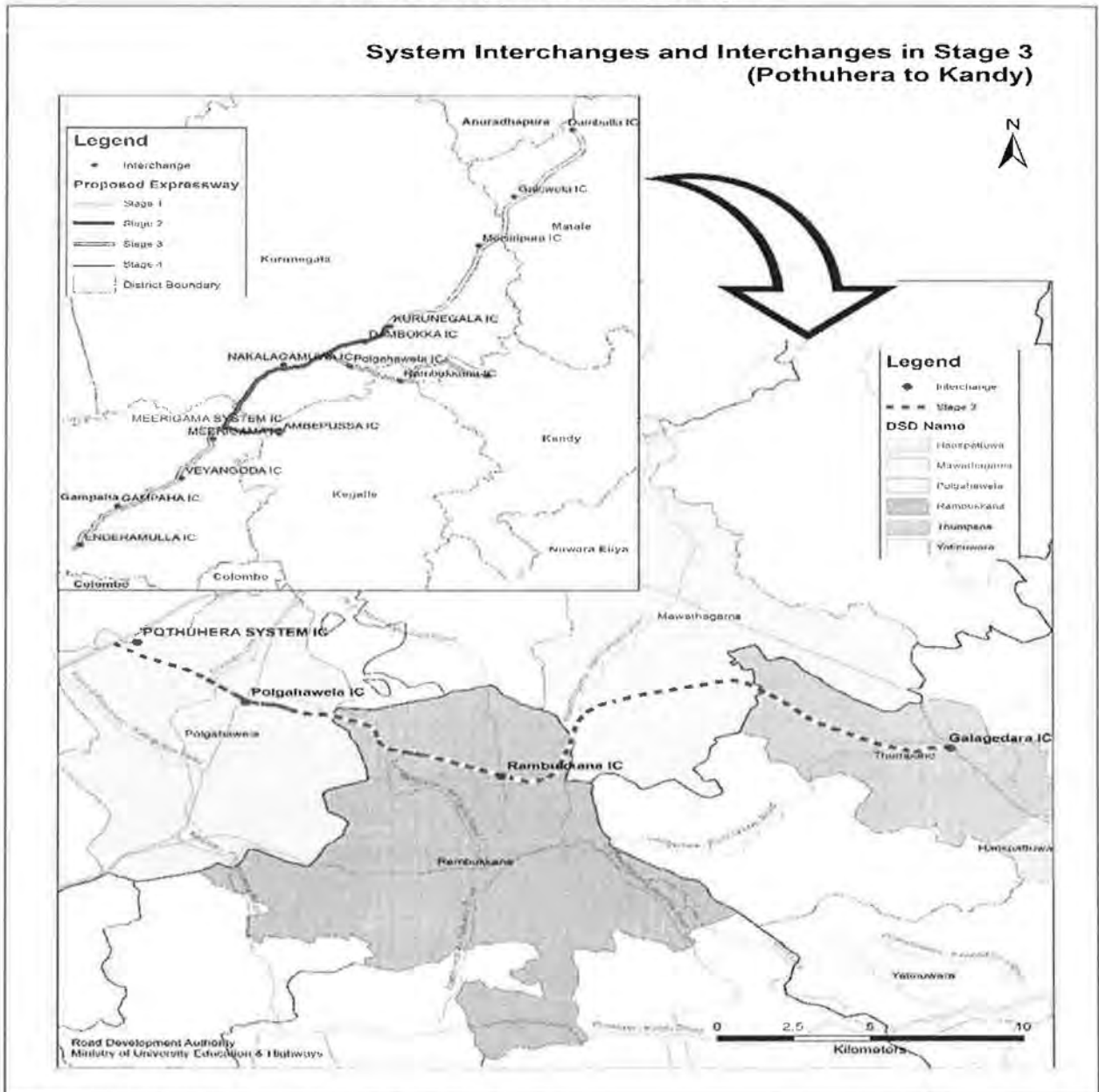
Map 01: Proposed CEP and Stages